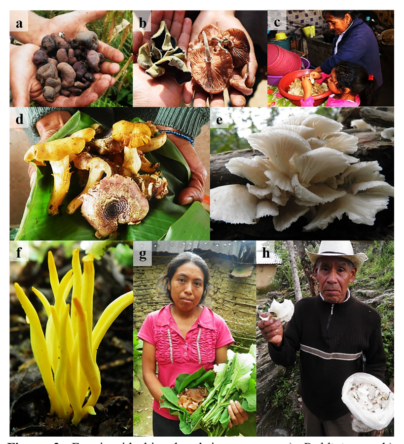
Figure 2. Fungi with biocultural importance. a) Daldinia sp. b) Auricularia nigricans and Armillaria mellea . c) "Honguera" (mushroom gatherer) and granddaughter cleaning mushrooms in order to cook them. d) Mushrooms of the genus Cantharellus known as tjiin ítá . e) Pleurotus spp. f) Clavulinopsis fusiformis , called mouse "milpa" ( jno nisen ) or lizard "milpa" ( jno tsálá ). g) Example of good practice of transporting edible wild mushrooms using leaves and allowing spore dispersal. h) Collection of Pleurotus spp. in a plastic bag.

original language is occurring at accelerated rates, compared to the peripherical zones which are surrounded by primary vegetation.