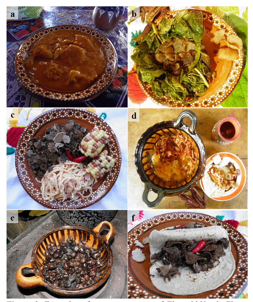
Figure 3. Examples of mycogastronomy of Eloxochitlán de Flores Magón, Oaxaca. a) "Tesmole" prepared with Pleurotus spp., b) Auricularia tremellosa with Piper auritum (known locally as "saint herb"); c) Toasted Schizophyllum commune and Schizophyllum radiatum with native maize and spaghetti; d) Cantharellus spp. with tomato sauce and onions; e) Roasted Daldinia sp.; f) "Tacos" with boiled Schizophyllum commune and Schizophyllum radiatum .

consumes Pleurotus sp. after a detailed inspection of the sporomes.